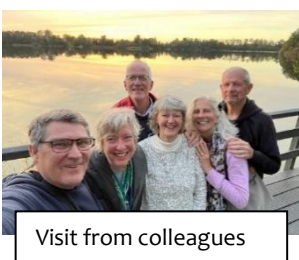
Visit from colleagues

organisations. We shared the resources that we use in the preparation for families who are going to go into mission.